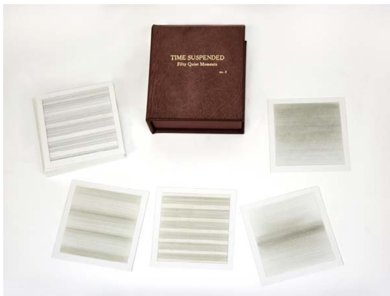
Time Suspended #3: Fifty Quiet Moments (detail) 2010 mixed metal point on white Pike paper 3.5 x 3.5 inches (drawings) 4.5 x 4.5 x 2 inches (box) pictured above: box with 5 drawings pictured right: detail, 9 drawings from the full set of 50